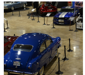
San Diego Automotive Museum

1/2/24 (virtual) 4/18/24 (in person) 7/2/24 (virtual)