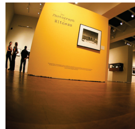
Museum of Photographic Arts at SDMOA

3/5/24 (virtual) 6/20/24 (in person) 9/3/24 (virtual) 12/19/24 (in person)