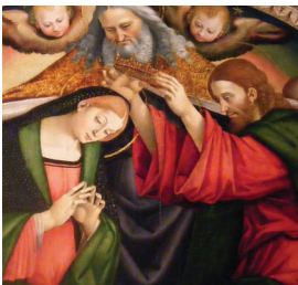
San Diego Museum of Art

5/7/24 (virtual) 8/15/24 (in person) 11/5/24 (virtual)