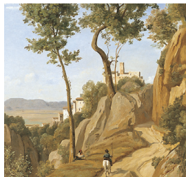
Timken Museum of Art

2/15/24 (in person) 10/17/24 (in person)